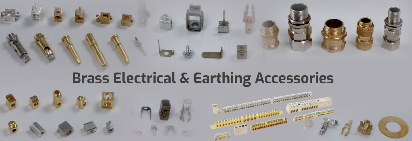
Brass Electrical & Earthing Accessories