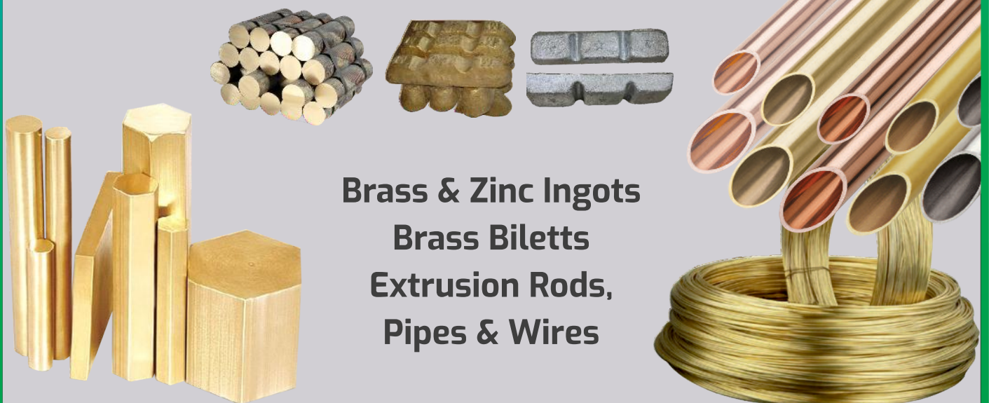
Brass & Zinc Ingots Brass Billets Extrusion Rods, Pipes & Wires