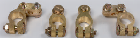
Brass Battery Terminals