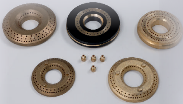
Brass Gas Parts