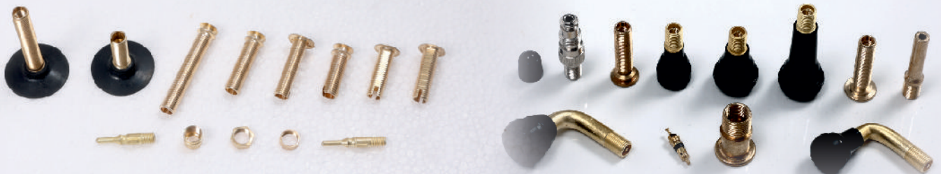
Brass Bicycle & Auto Tube Parts