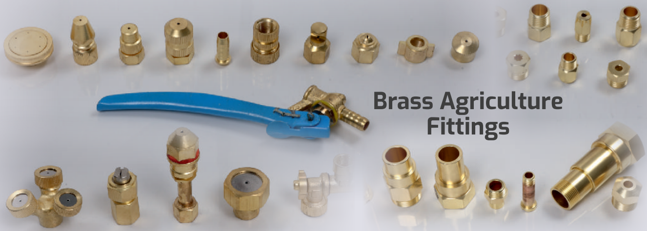
Brass Agriculture Fittings