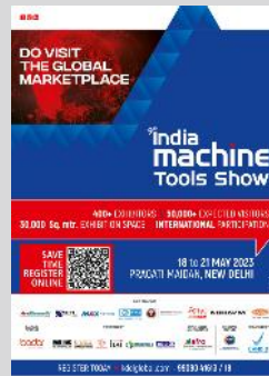
Opportunity For You