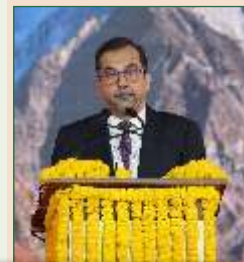
Mr. Sanjiv Puri Managing Director, ITC Limited