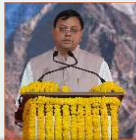
Shri Pushkar Singh Dhama Hon. Chief Minister of Uttarakhand