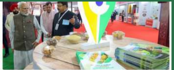
Prime Minister Narendra Modi inspects an exhibition at the venue of the Global Investors Summit 2023, in Dehradun on Friday.

पीएम मोदी ने निवेशकों से कहा, मध्यम वर्ग की क्षमता पर ध्यान दें