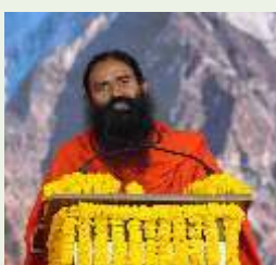
Baba Ramdev Patanjali Ayurved Limited