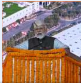
Shri Narendra Modi Hon. Prime Minister of India