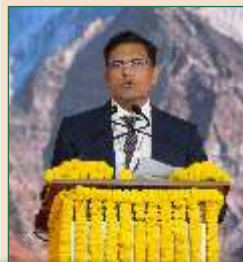
Mr. Sajjan Jindal Chairman & MD, JSW Energy Limited