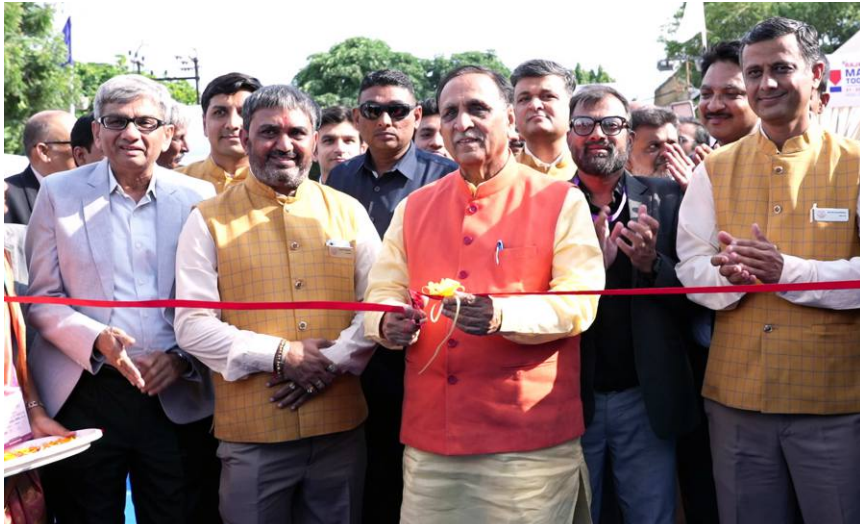
The 8 th Rajkot Machine Tools Show 2022 (RMTS-2022) was inaugurated on September 21 st , 2022 by Shri Vijaybhai Rupani , Hon'ble Former Chief Minister, Gujarat