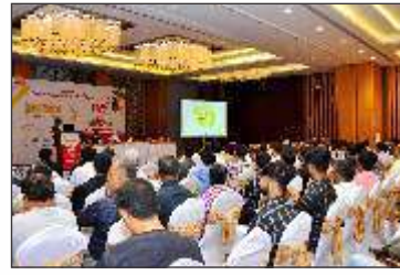
Guests watching Engimach 2023 video presentation