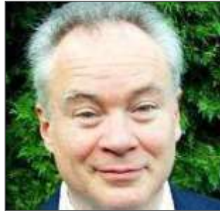
Paul Werbos NSF USA