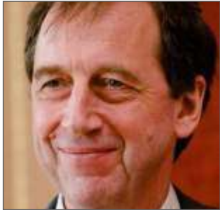
Philp Boxer Requisite Agility